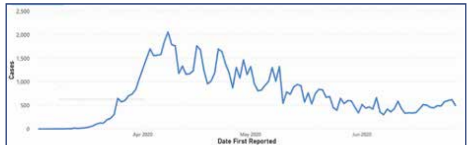
Pa. Dept. of Health reports a decline in COVID-19 cases since April

Gov. Wolf announced a similar order announcing masks must be worn whenever anyone leaves home.